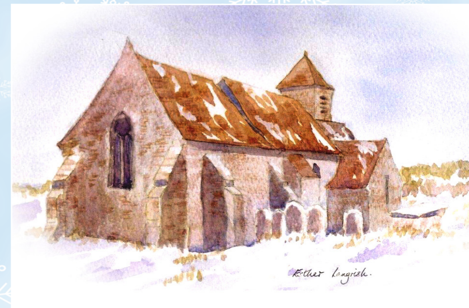
A collection of carols for the Climate Crisis written by villagers from Binsted in West Sussex, where campaigners are fighting to stop the planned A27 Arundel Bypass.